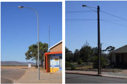
(Faulty or Blown)

Contact: SA Power Networks – 131261 and quote pole number or https://slo.apps.sapowernetworks.com.au/