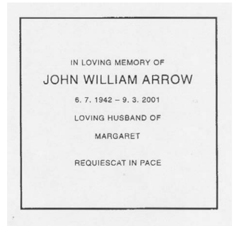
229mm x 229mm

*Please note that if placing emblems and/or ceramic photographs on plaque, because of the plaque's size this will reduce the number of lines on plaque